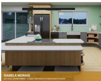
Isabela Lopes Morais DDA 2021 Gold Award Winner - Student Universal Kitchen Design